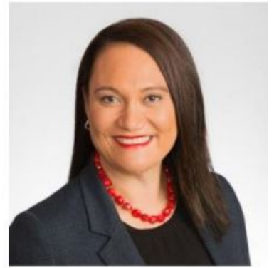
Hon Carmel Sepuloni

As the Minister for Disability Issues, I am committed to building a more inclusive and accessible society and ensuring disabled people have the same opportunities as other New Zealanders. That's why I am pleased to release this annual report on implementation of the New Zealand Disability Strategy 2016-2026.