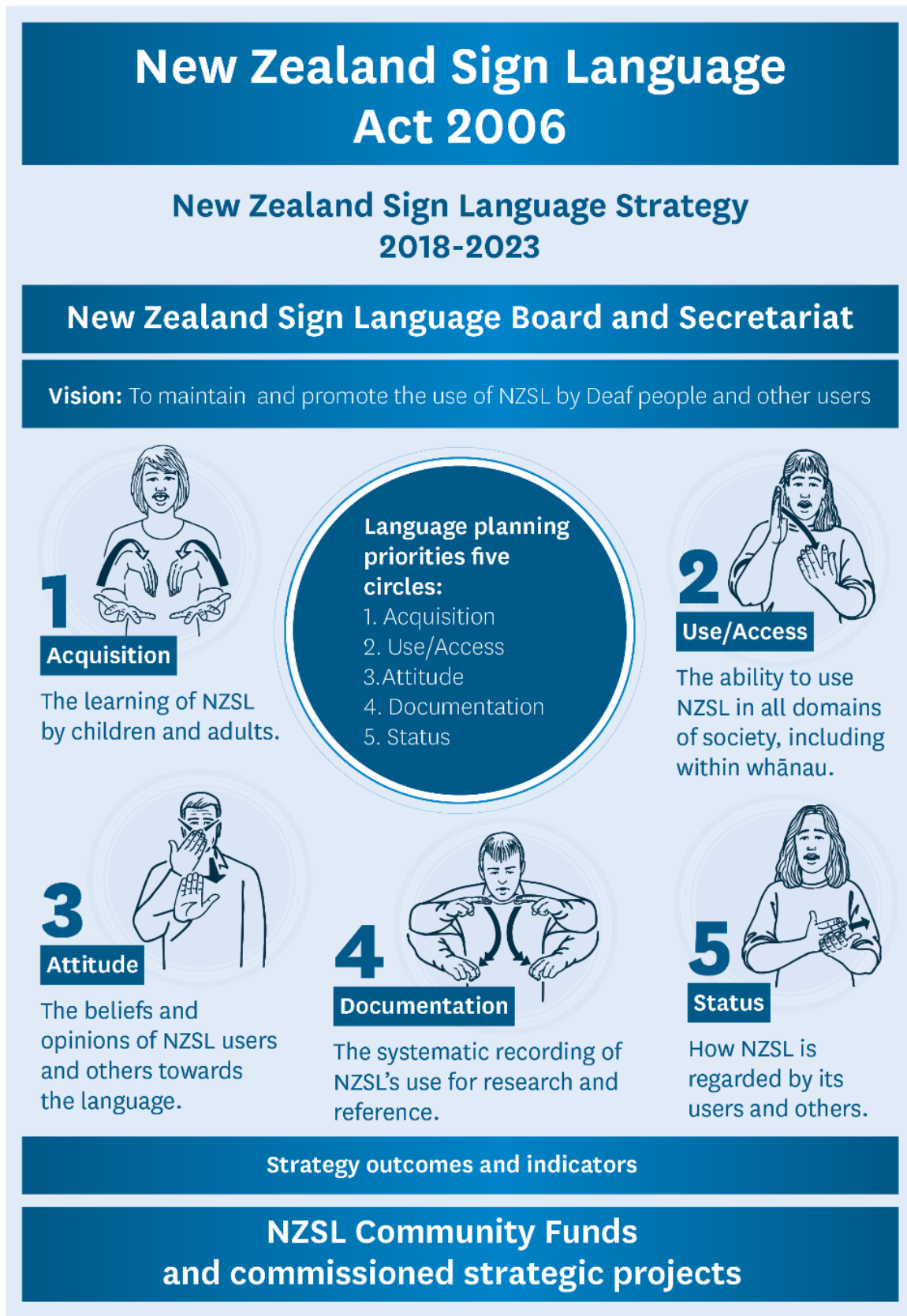
Figure 2: The relationship between the NZSL Act 2006, the NZSL Strategy 2018-2023, the NZSL Board and its Secretariat