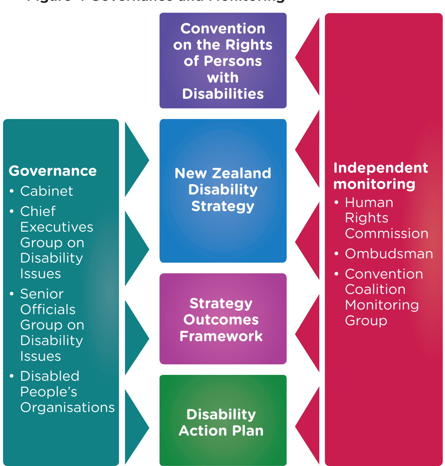
Figure 4 Governance and Monitoring