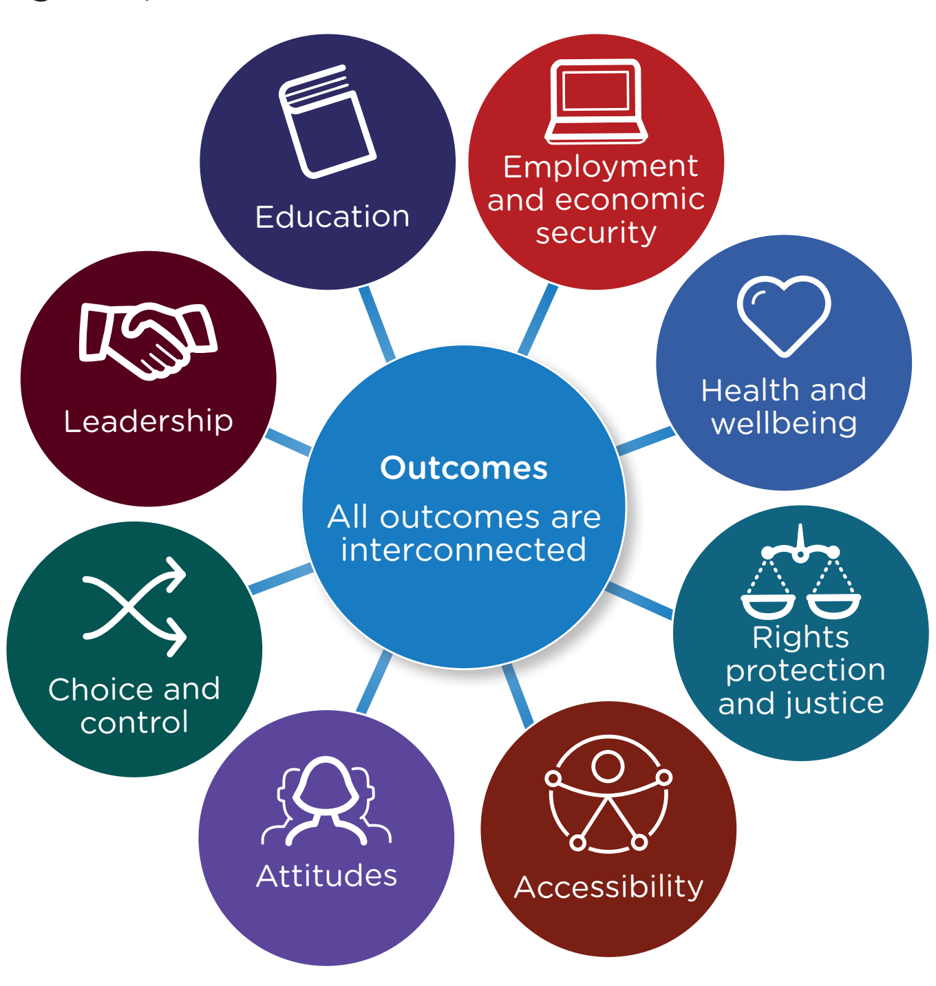
Figure 3 | Interconnections of outcomes